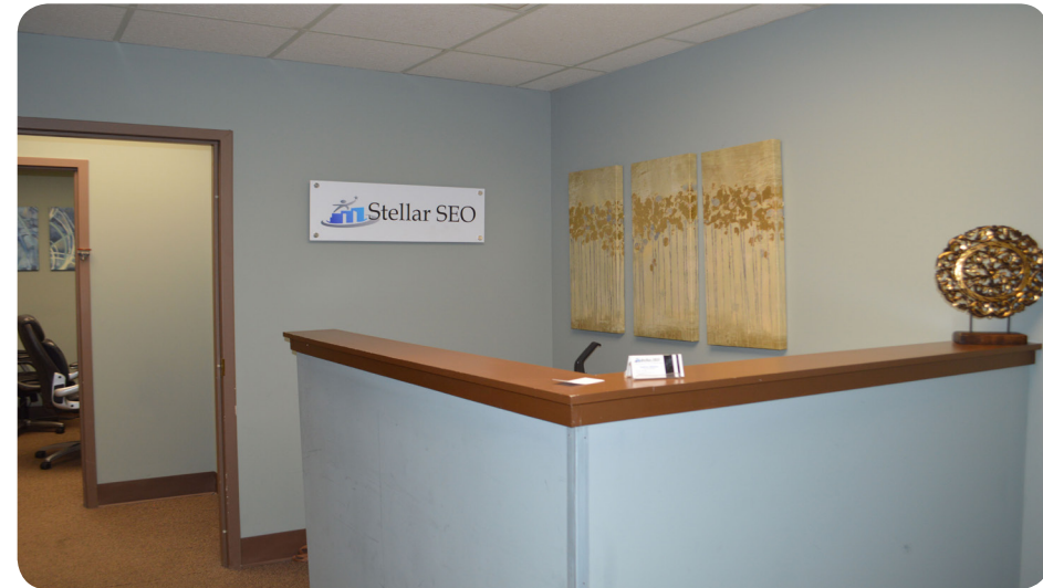
St. 101- Reception/ Waiting Area (3) Private Offices