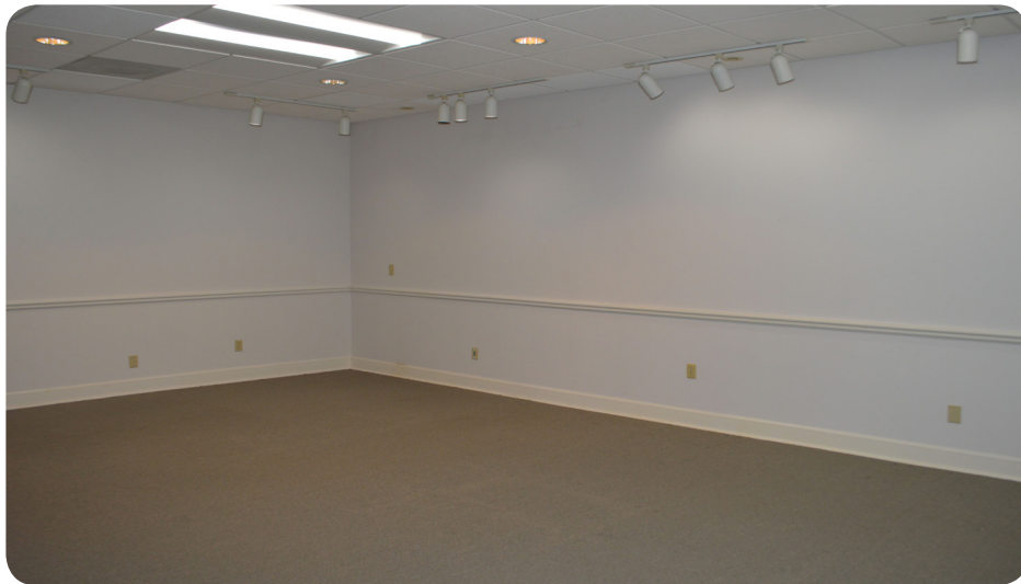
St. 113- Waiting Area/ (2) Private Offices