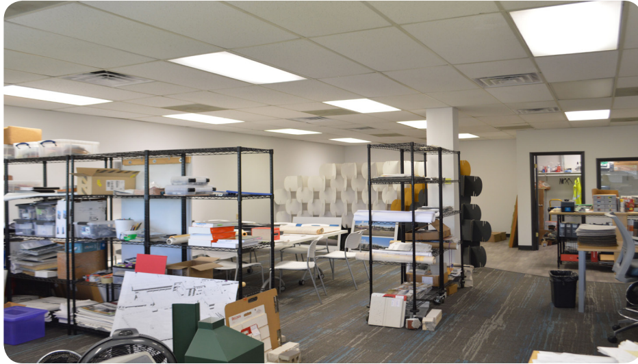
St. 205- Open Work Space & Open Windows