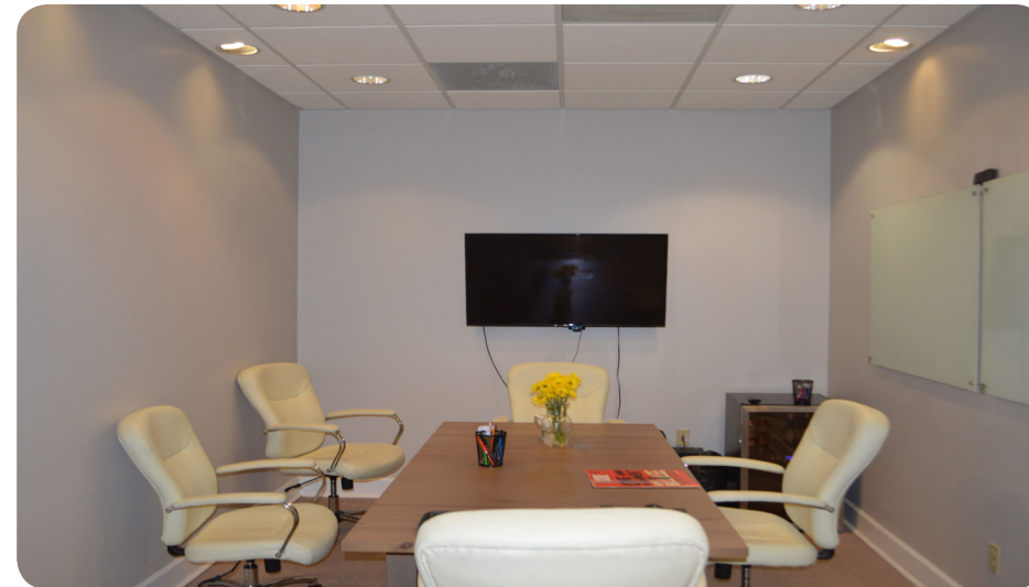
St. 106- Reception/ Waiting Area (3) Private Offices/ Conference Room Break Area/ Open Work Space