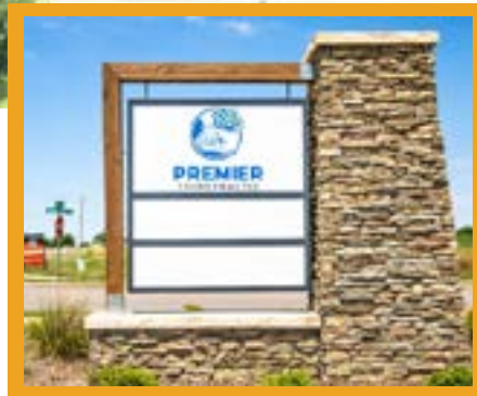
Pylon Signage Available Additional space will be built