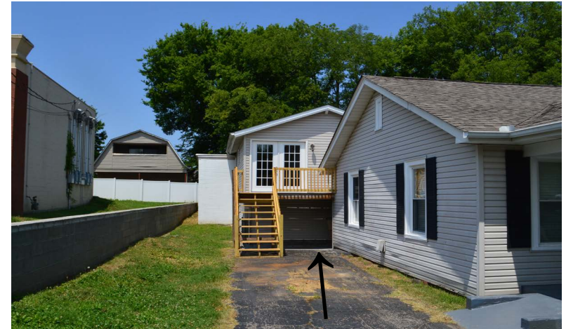
Upstairs Large Private Office or Open Work Space