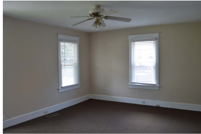
Renovated Office Area with New Carpet, Paint, and Remodeled Restrooms