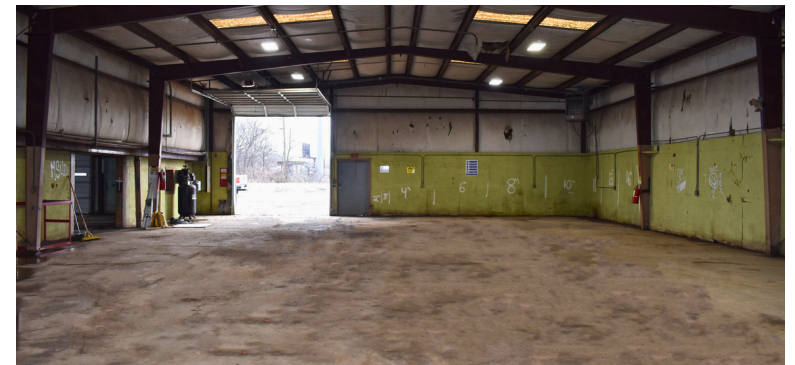
Clear Span in Half of Building

A portion of this property is located within the Flood Plain described by FEMA