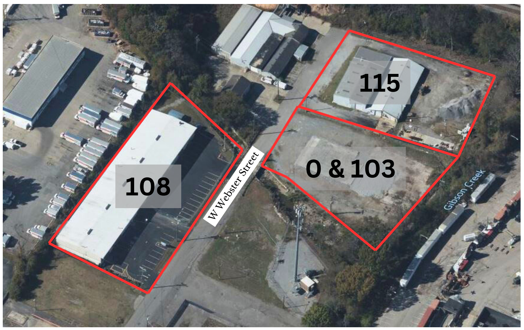
A portion of this property is located within the Flood Plain described by FEMA