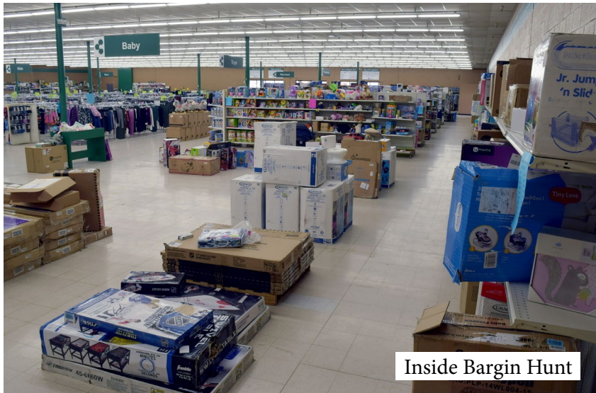
Inside Bargain Hunt