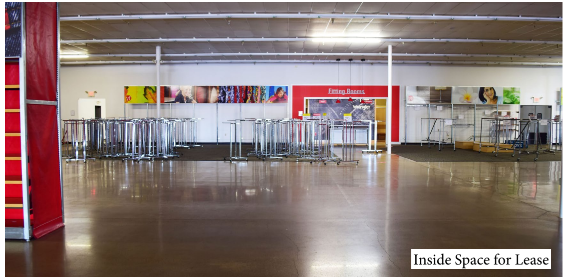
Inside Space for Lease