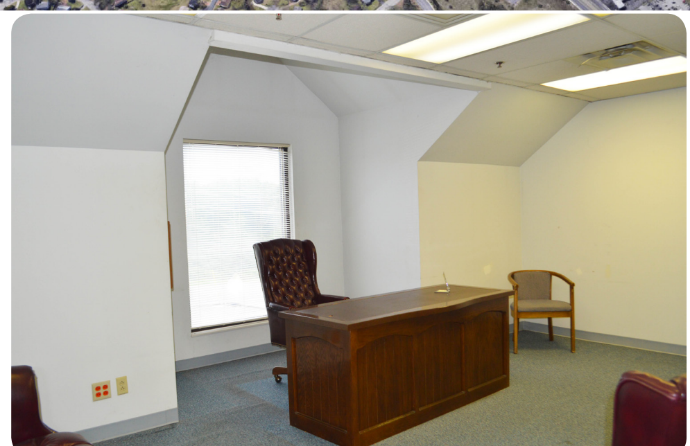
Information contained herein has been obtained from the owner of the property or from other sources we deem reliable. All information should be verified prior to purchase or lease.