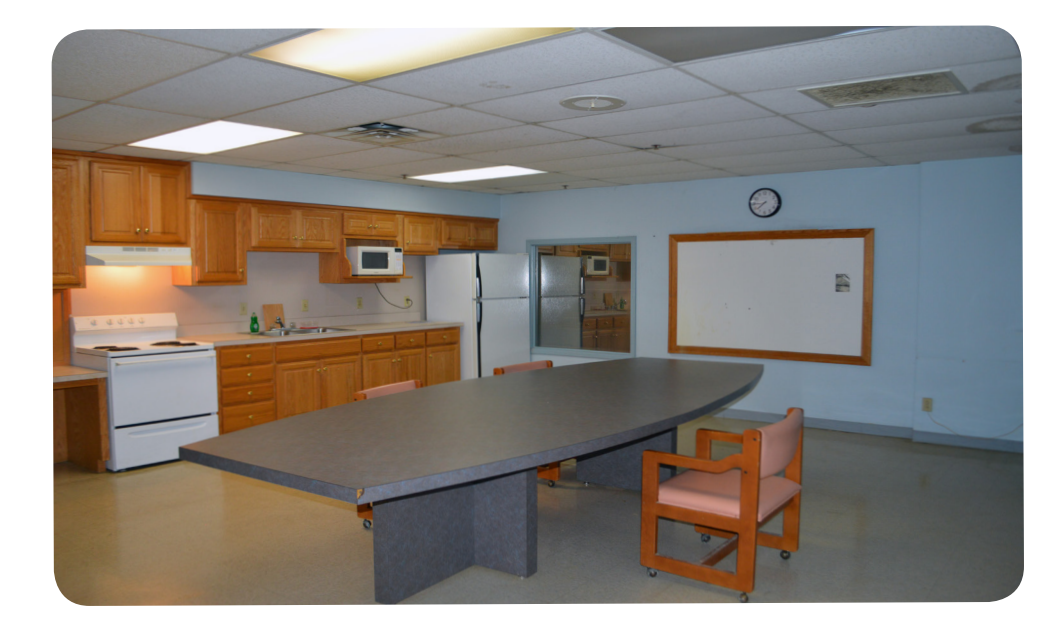
Information contained herein has been obtained from the owner of the property or from other sources we deem reliable. All information should be verified prior to purchase or lease.